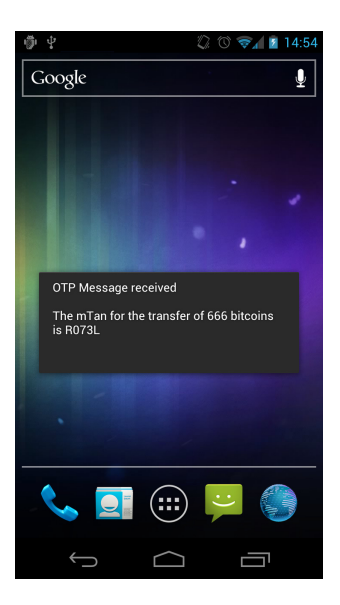
Fig. 6. The OtpMessages Application receives an SMS containing an mTAN OTP.